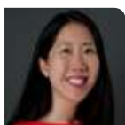
ANGELA LEE Columbia Business School

International faculty masterfully weave business theory with practice, allowing participants to apply what they learn in the classroom into their current positions in real-time.