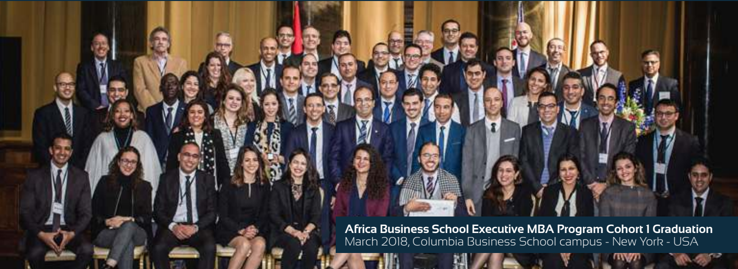
Africa Business School Executive MBA Program Cohort 1 Graduation March 2018, Columbia Business School campus - New York - USA