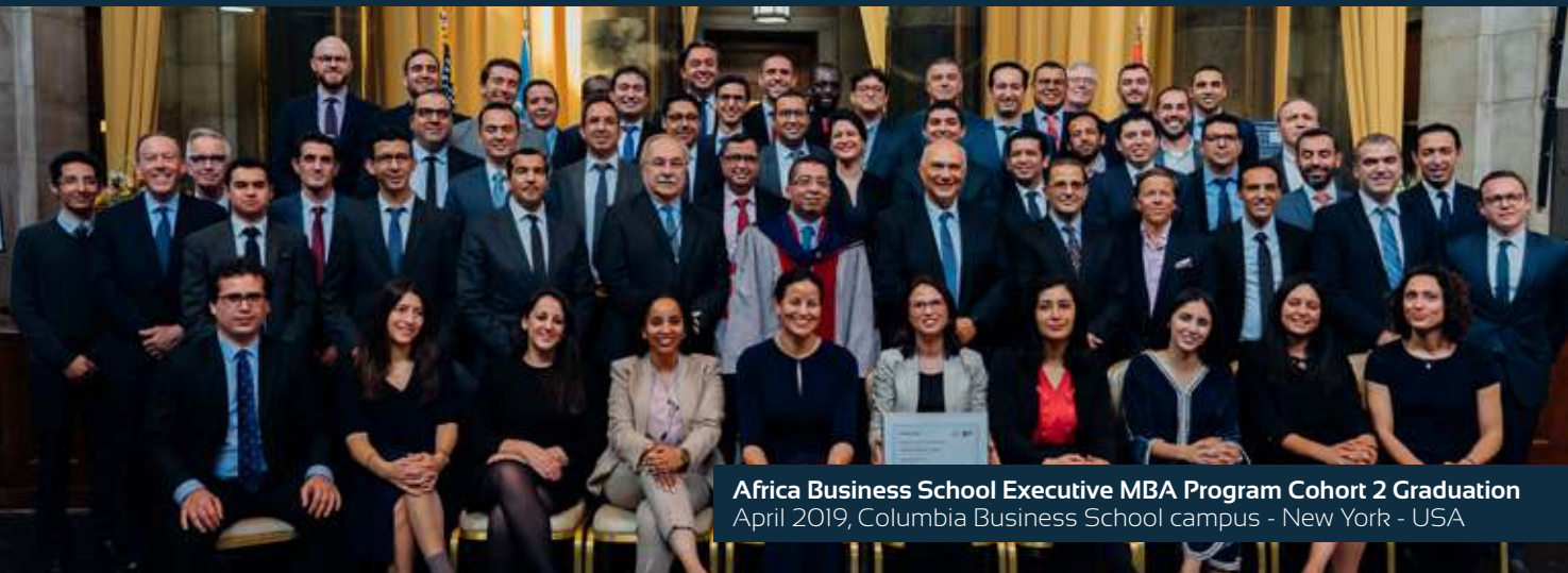
Africa Business School Executive MBA Program Cohort 2 Graduation April 2019, Columbia Business School campus - New York - USA